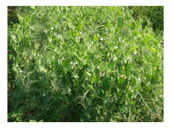
Figure 2. An intercrop of the serai-leafless and normal-leafed dryp

These results pose opportunities for further research. These two cultivars were intentionally chosen for intercropping due to similar growing habit and developmental stages. However, future research could provide a more stringent evaluation of intercropping by developing F5- or F6-derived near isogenic semileafless and normal-leafed varieties (9).