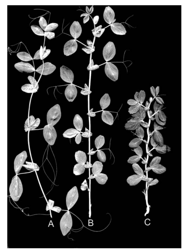
Fig. 1. SGE-0284 and SGE-1003 plants: A – normal SGE plant; B – SGE-0284 mutant; C – SGE-1003 mutant. Note: the internode length of the mutants is slightly (SGE-0284) and strictly (SGE-1003) diminished compared to the parental normal line, SGE.

During the screening of the EMS-treated pea line SGE, M<sub>2</sub> progeny, the two new mutants SGE–0284 and SGE–1003 were isolated, characterized with the effect on tendrils and leaflet shape and also the internode length. These mutants are shown at Fig. 1.